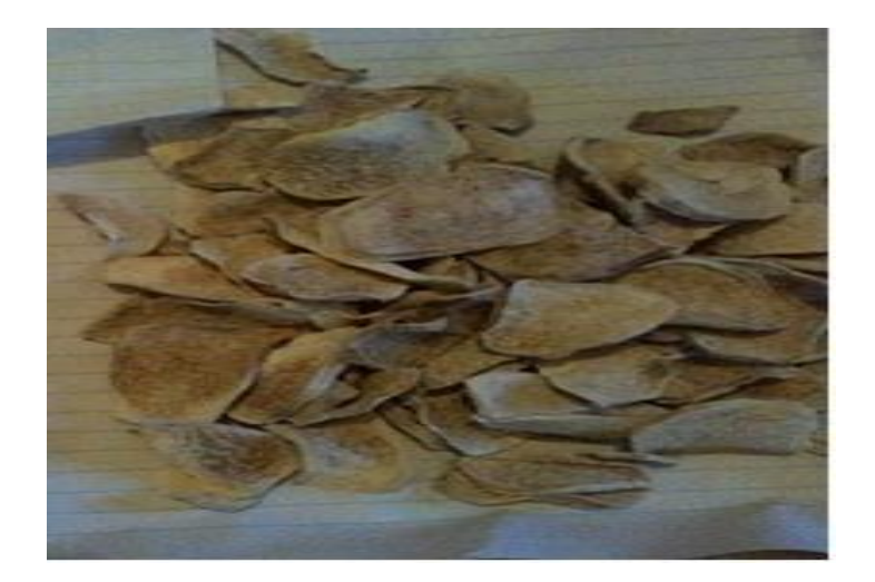
Plate 3: Late harvest peeled, sliced, and oven-dried trifoliate yam chips (LUOD)