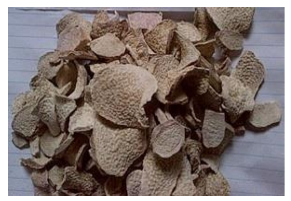
Plate 1: Normal harvest peeled and oven-dried trifoliate yam chips (NUOD)

The normal and late harvests of trifoliate yam for this work were sourced from Ngwu – Uzuakoli in Bende Local Government Area of Abia State, Nigeria.