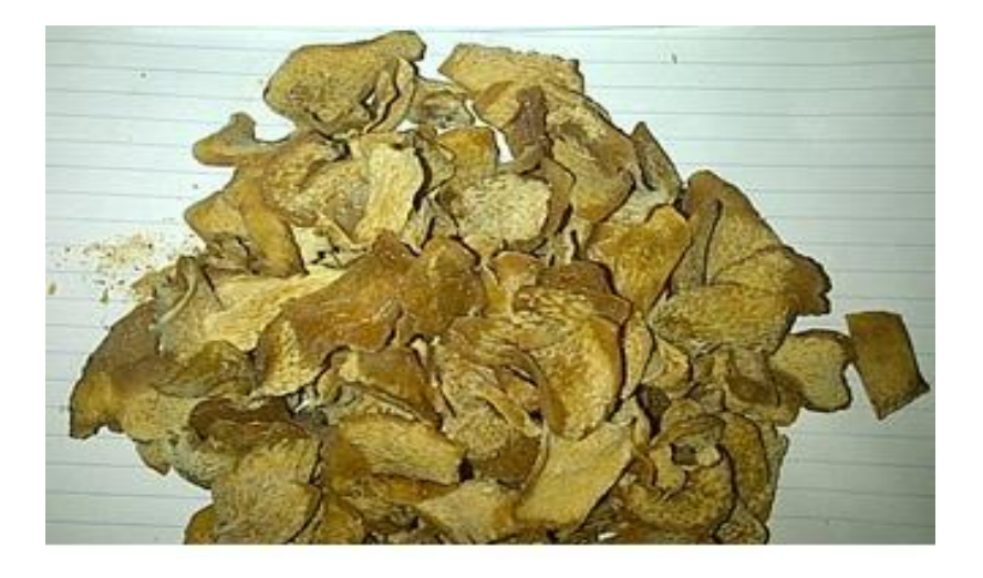
Plate 5: Late harvest cooked, peeled and oven-dried trifoliate yam chips (LCOD)

Plate 4: Late harvest peeled, sliced, steeped for 24hrs and oven-dried trifoliate yam chips (LSOD)