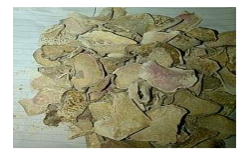
Plate 4: Late harvest peeled, sliced, steeped for 24hrs and oven-dried trifoliate yam chips (LSOD)

Plate 3: Late harvest peeled, sliced, and oven-dried trifoliate yam chips (LUOD)