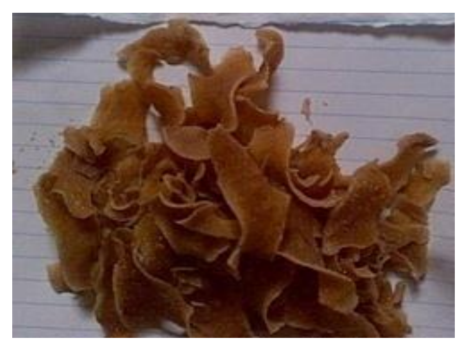
Plate 2: Normal harvest cooked, peeled and oven-dried trifoliate yam chips (NCOD)